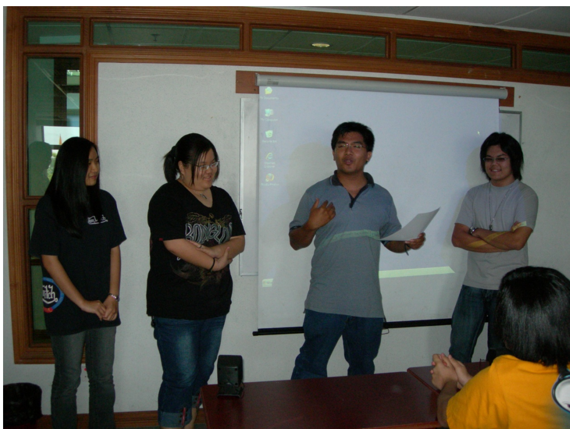
Presenting their stories, their views