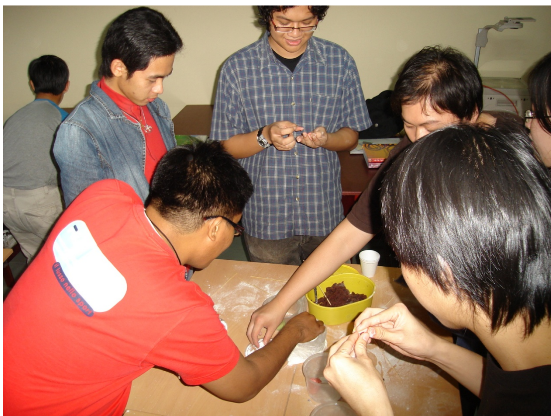
Making 'dango', a Japanese dessert specialty