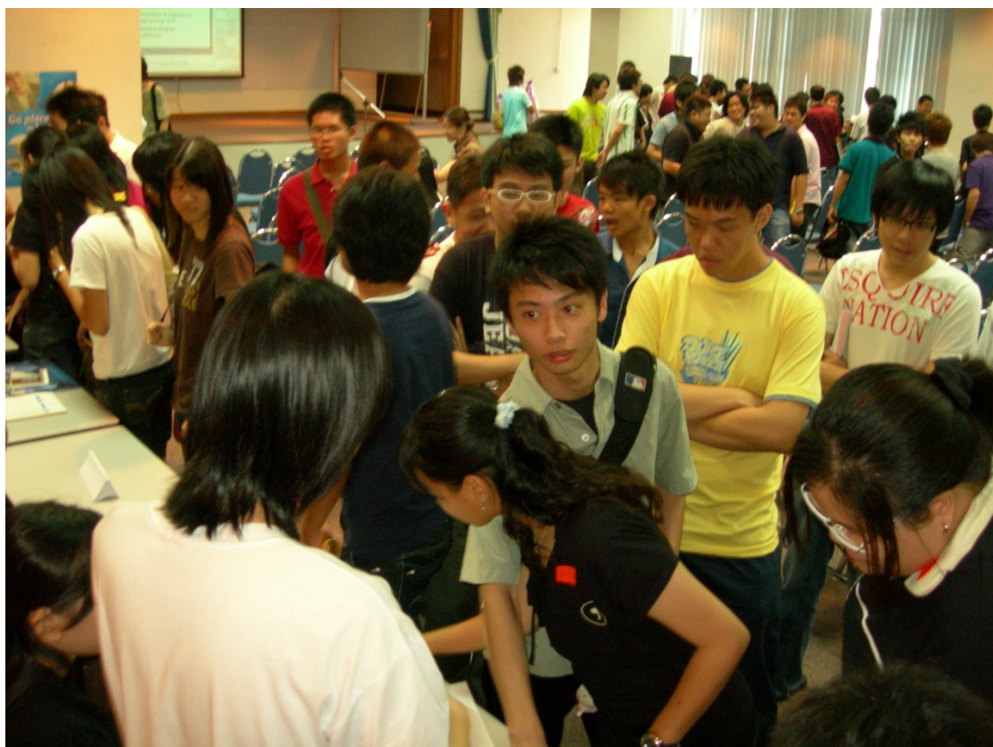
Potential new members, who have become members