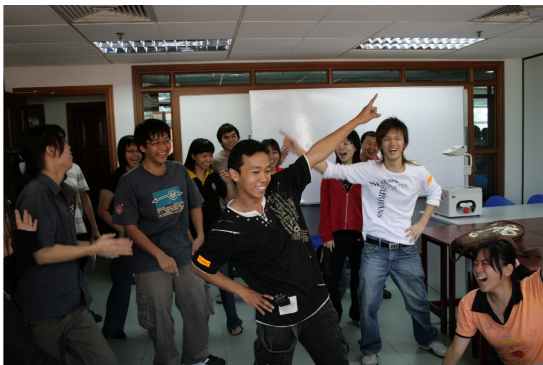
We had the fresh students dance a bit to release tension