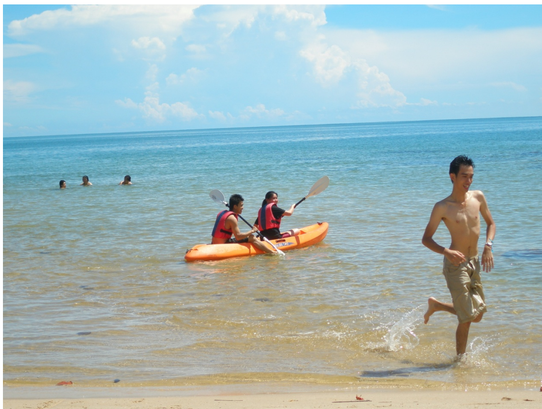
Members enjoying themselves, in different ways...