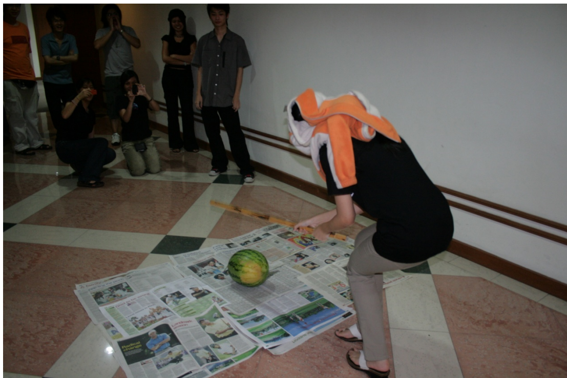
Watermelon hitting, a Japanese summer beach activity