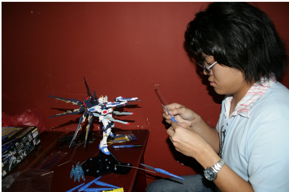
Our members demonstrating their skills