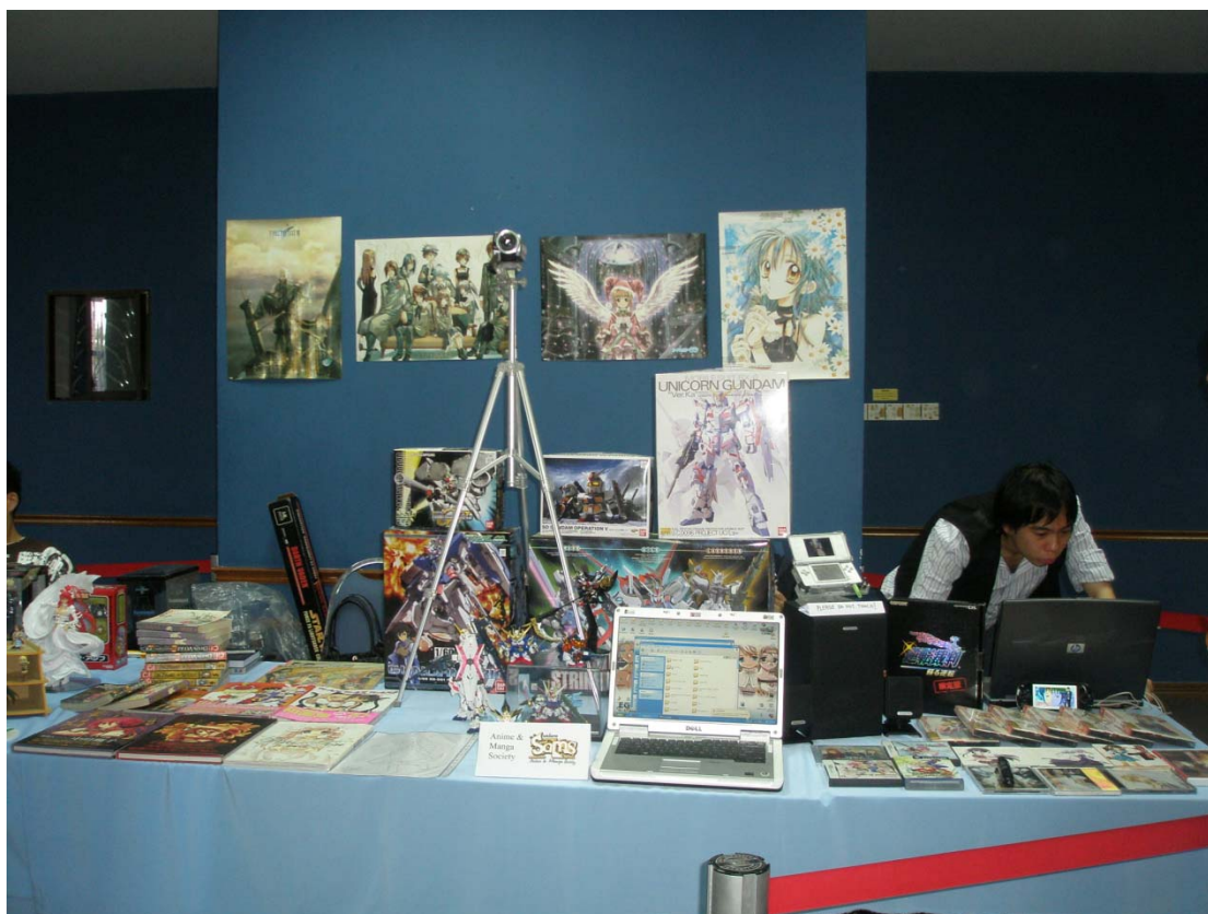
Our booths, the display items all belonging to members