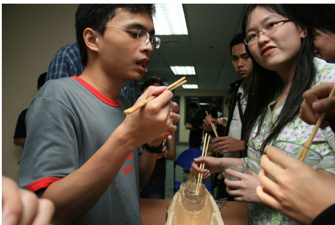
Our soumen party, also a Japanese summer activity. This activity was done together with our recent Movie Night.