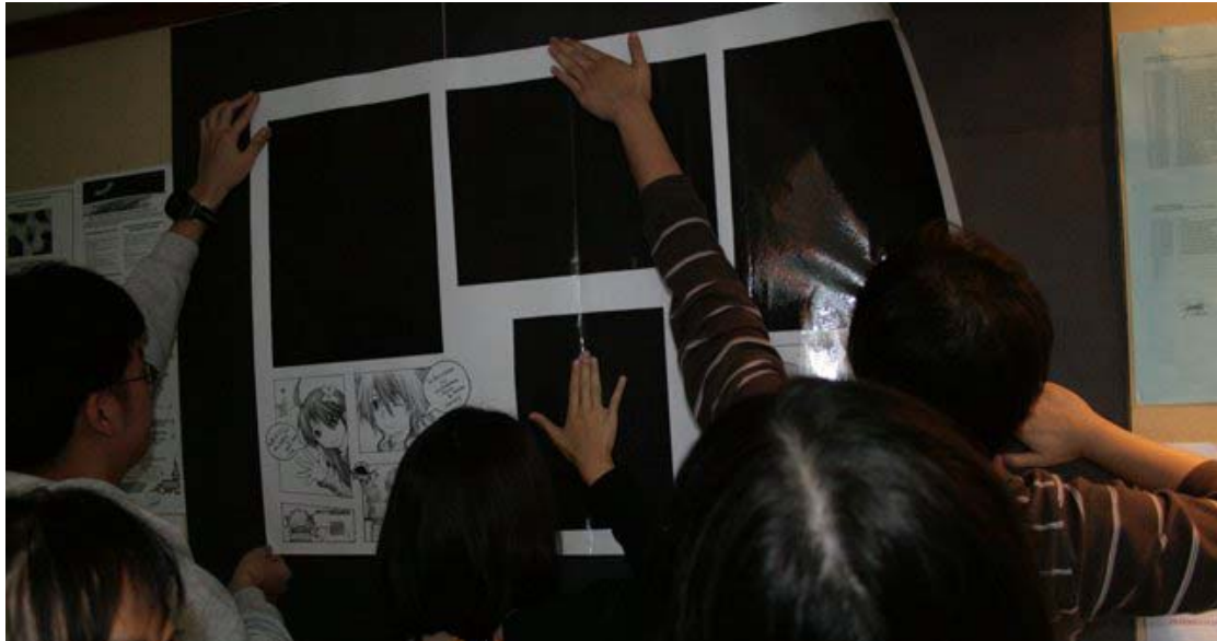
SAMS putting up our notice board together

As you turn the pages, we would like to acknowledge that only with our full effort and the sacrifice of our time has our activities become true successes. We hope that the fruits of our efforts will be an inspiration to the people out there as well to you, our dear reader.