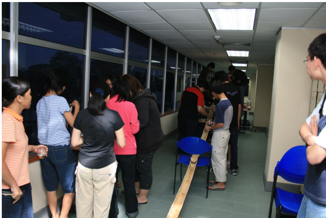
New and current members waiting for the flowing noodles